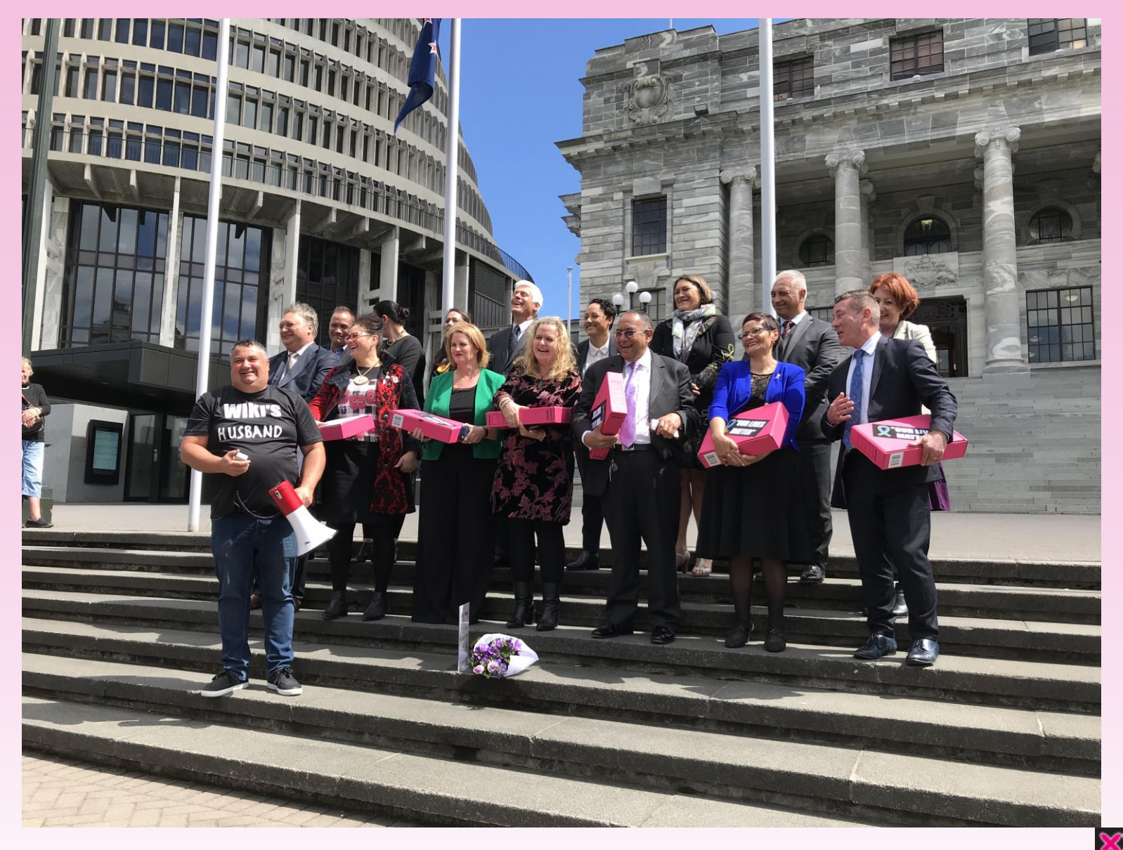
17 MPs accepted Ibrance and Kadcyla petitions