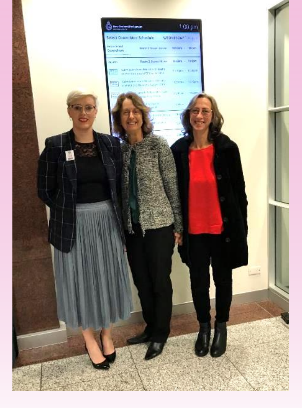
Health Select Committee hearings