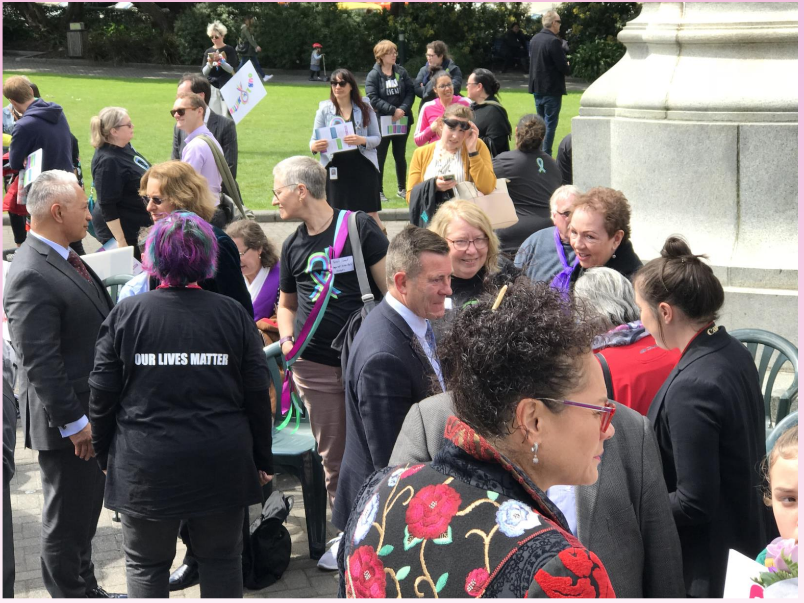
Politicians have the power to reform